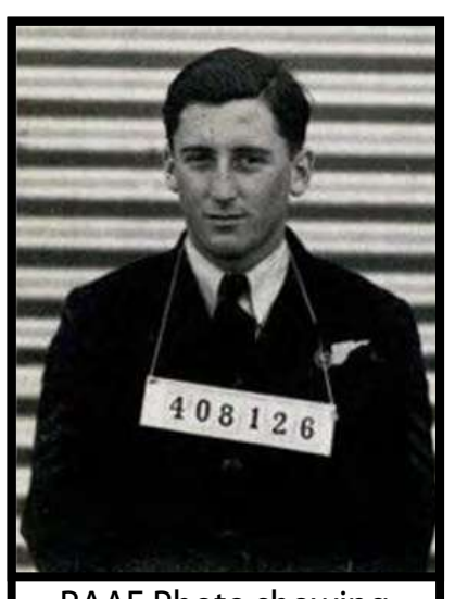
RAAF Photo showing Service Number

"I remember all the details of the first bombing of Darwin. It's been tattooed onto my brain for 70, 80 odd years.