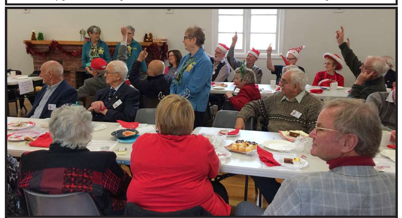
Members got involved in a most enjoyable Christmas Story item provided by members of the Sing Australia Choir