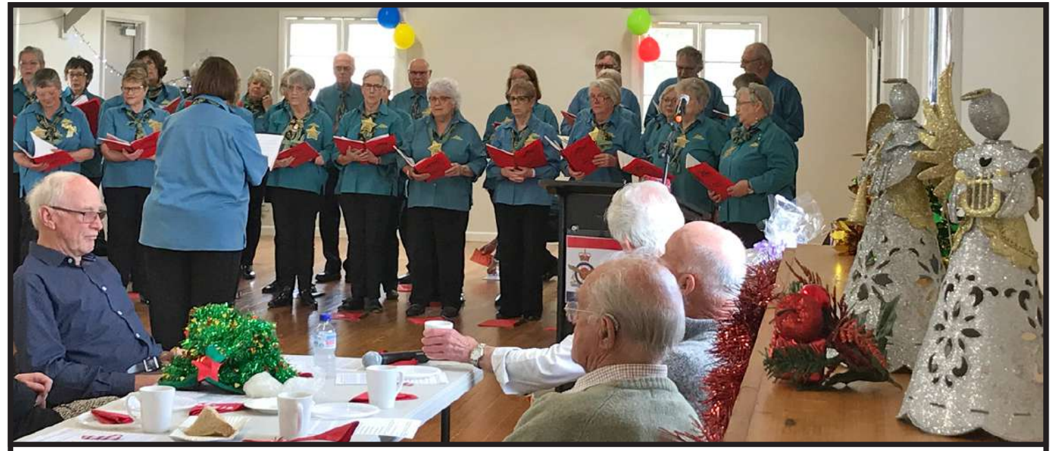
Our very good friends, Sing Australia Choir Ballarat, entertained us with Christmas songs and carols