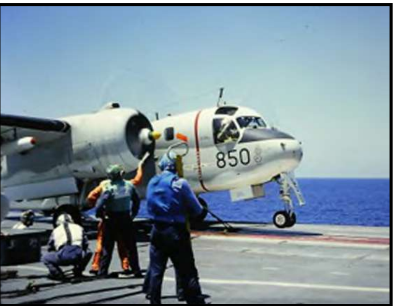
At sea 1972 'UP TOP' (in South East Asia) on patrol during the Cold War. S2E Tracker anti-submarine aircraft 850 from VS 816 Sqn 'Fighting Tigers', set for catapult launch from HMAS Melbourne. Aircraft is armed with 2.75" rocket pods.