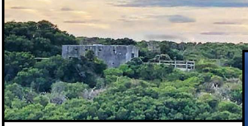
Cape Otway Radar Bunker