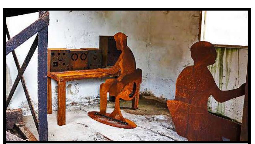
The use of Corten Steel silhouettes to depict RAAF staff at work is an interesting concept. (Above and Top Right images)