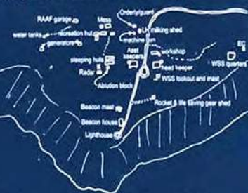
Cape Otway during WWII.

No Lightstation or Navy personnel were allowed on the top secret base. However we know that the Keepers' children visited often.