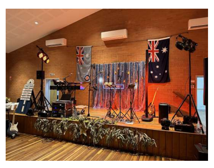
The stage is set!