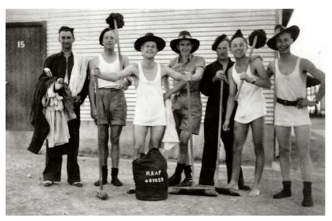
In this photo of No. 9 WAGS course 1940, only 3 of the 8 (including the photographer) survived the war.

Kevin also supplied other photographic memorabilia, some of which is preserved on the 1WAGS website.